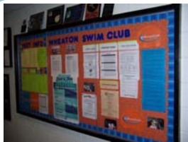
The Team Bulletin Board at Wheaton College.

The bulletin board has loads of information. Also check the team website daily for updates!