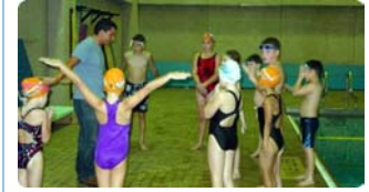
Private Swim Lessons or Competitive Swim Lessons are a great place to learn, have fun, and try things out.

Get Involved!! Tell a Friend!! For full information about competitive lessons or semi-private lessons, contact the coaching staff today!